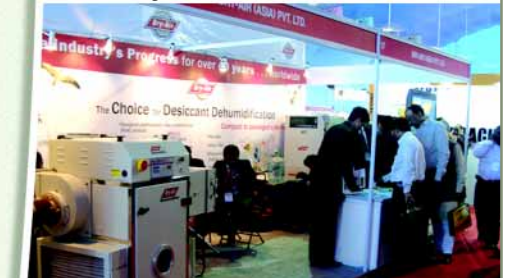
IPC Pharma – Dec. 08 Delhi