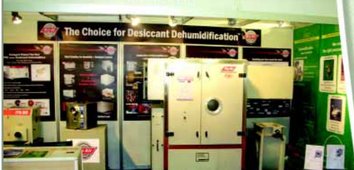
ISK Sodex – May 08 Turkey