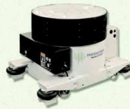
Electrodynamic Vibration Testing