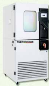
Standard Series Chambers