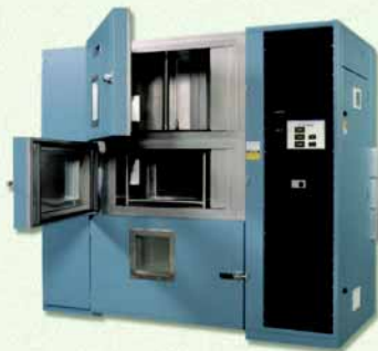
Thermal Shock Chambers