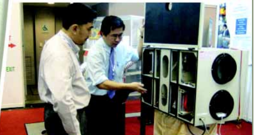
REVAC – 08 Malaysia