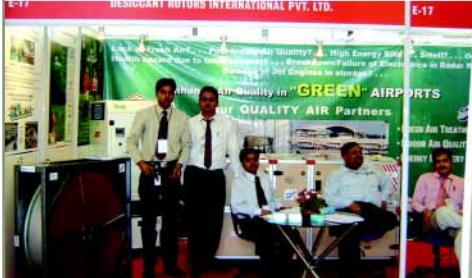
S.E. Pharma Show – March 08 Malaysia BRY-AIR MALAYSIA SDN BHD