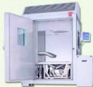
Accelerated Stress Testing (AST)