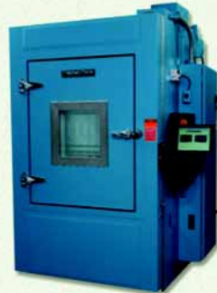
Environmental Stress Screening (ESS)