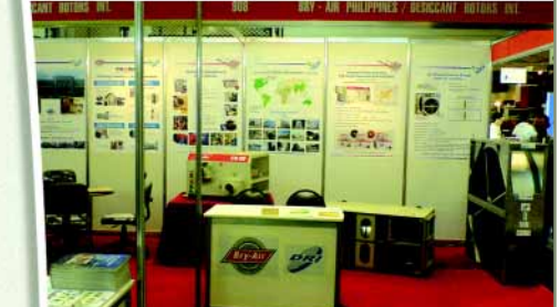
HVAC&R – Nov. 08 Philippines