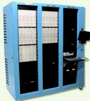
Product Test Solutions