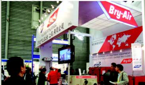
China Refrigeration – April 08 Shanghai BRY-AIR (ASIA) PVT. LTD