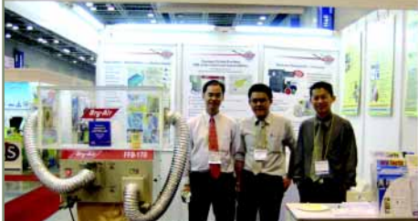
Civil Aviation – March 08 Delhi