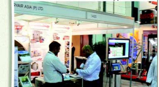
Big 5 Show – Nov. 08 Dubai