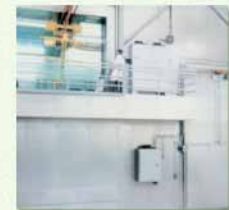
Speciality & Custom Chambers