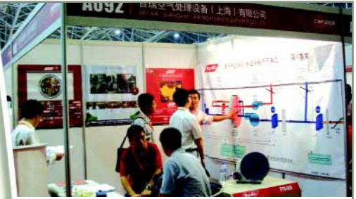
8th China Intl. Battery Fair – June 08 China