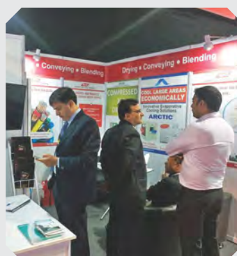
Wire India 2018, Mumbai