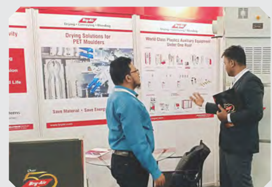
Ind Plas 2018, Kolkata