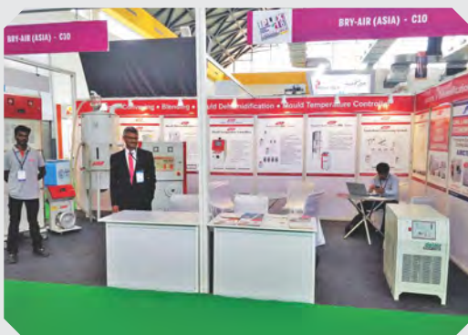
IPLX 2018, Hyderabad