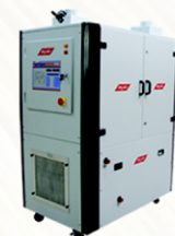
MDS Series 500 CMH to 3000 CMH Engineered above 3000 CMH