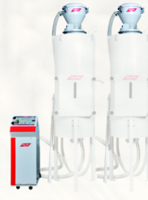
BVL (T) Series 100 kg/hr to 500 kg/hr Engineered above 1000 kg/hr