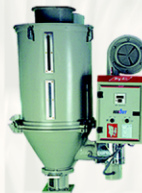
Hot Air Dryer 13 kg to 400 kg Engineered above 400 kg