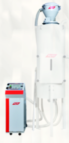
BVL (F) Series 150 kg/hr to 1000 kg/hr Engineered above 1000 kg/hr