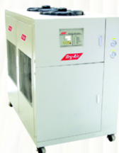
CHA Series 3.5 TR, 7.5 TR & 10.5 TR