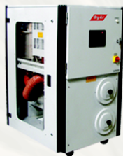
BHD Series 30 CMH to 3500 CMH Engineered above 3500 CMH