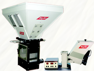
BGD Series 160 kg/hr to 2150 kg/hr Engineered above 2150 kg/hr BVD Series 0.2 kg/hr to 26 kg/hr Engineered above 26 kg/hr