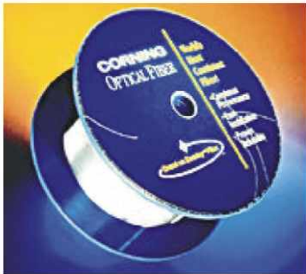
Finished spool of optical fibre

The buffer coating as well as the jacket is made of protective plastics. If the plastic coating itself is defective and retains moisture, one can imagine the disastrous results.