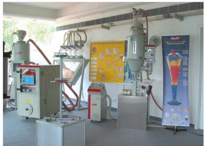
The 'Plastics' corner at the permanent display at Bry-Air's Corporate Office

Occupying a focal point in the Display is the entire Bry-Air Ecoplast range.