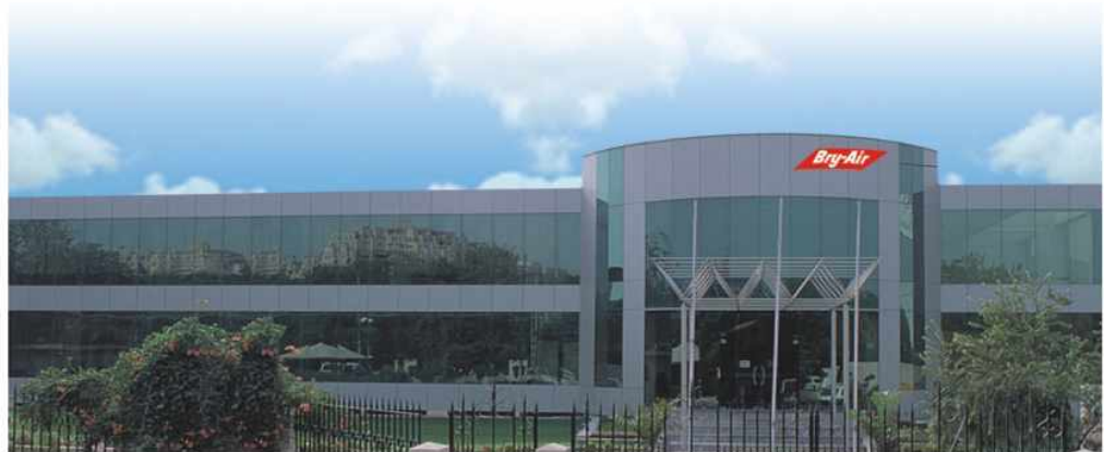
A front view of the Corporate Office and Plant III