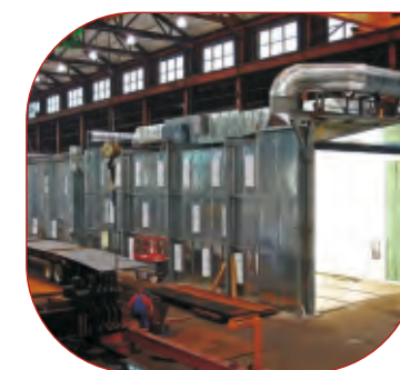
Automobile Paint Booth