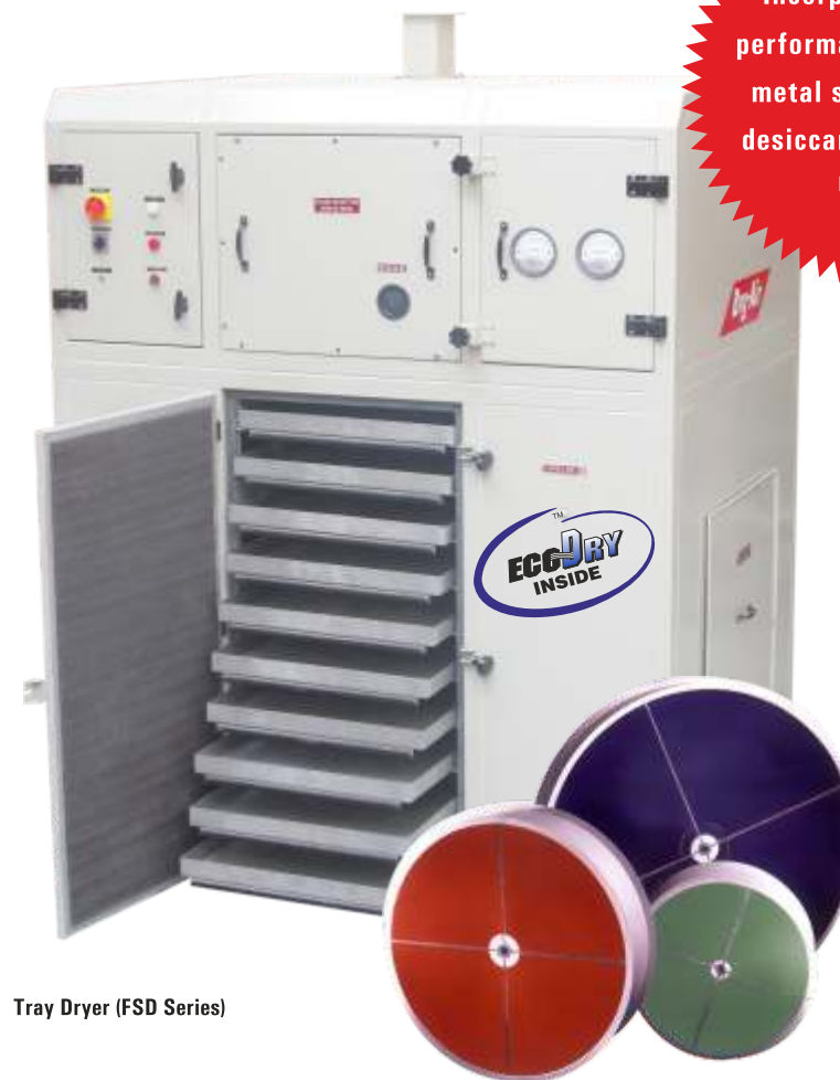
Tray Dryer (FSD Series)

Incorporating high performance, EGG DRY metal silicate fluted desiccant synthesized rotor's