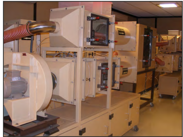
Test Lab for Active and Passive Desiccant Wheels