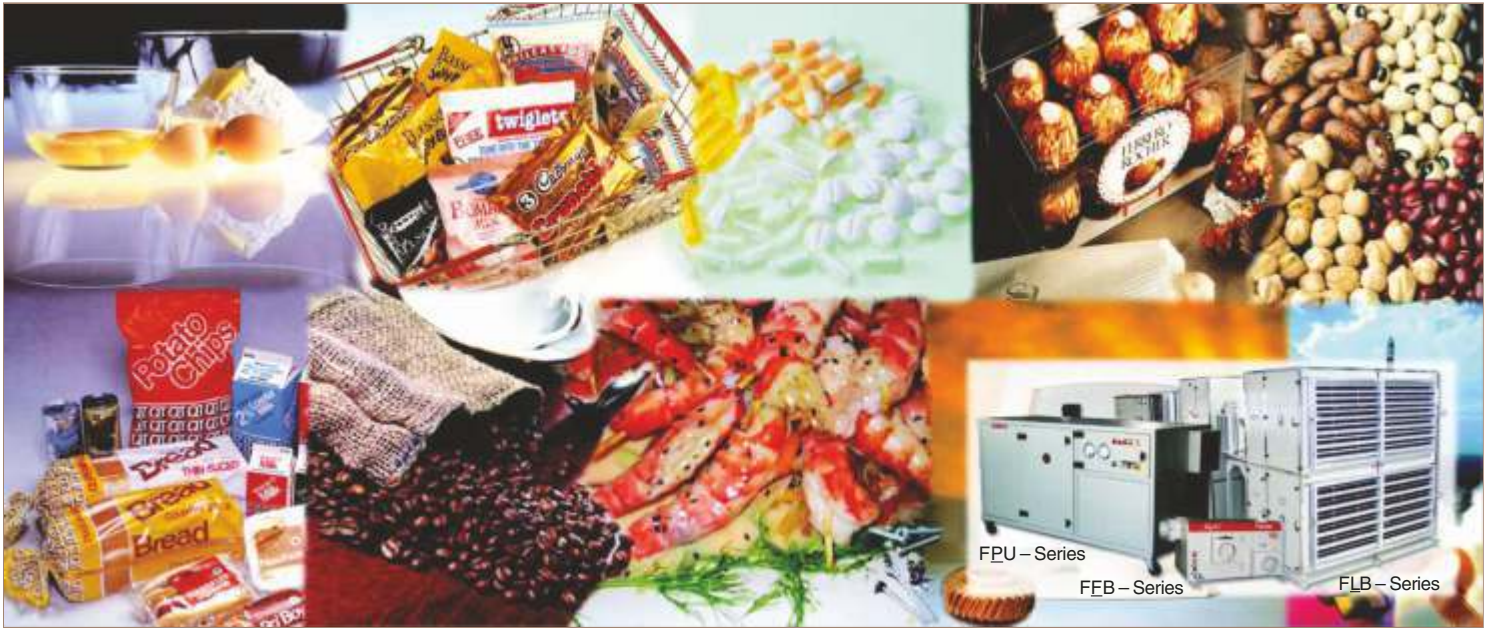
FPU – Series FEB – Series FLB – Series

Unlimited Applications: Bry-Air dehumidifiers help to remove humidity to the desired constant level by removing moisture from air effectively and economically. They are used successfully for research and development, manufacturing, processing, drying, testing, storage and packaging in almost all industries.