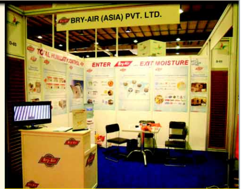
India Show – Turkey