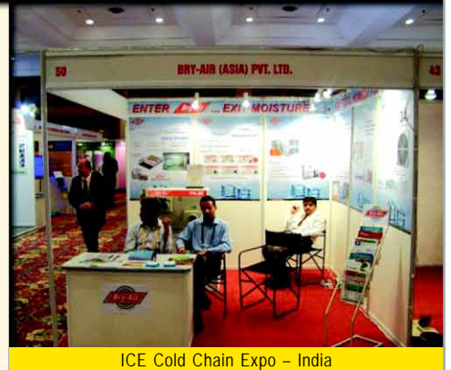
ICE Cold Chain Expo – India