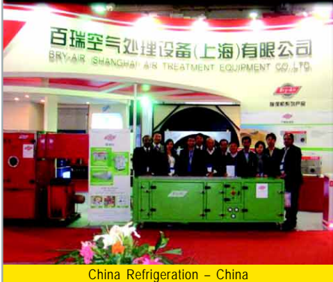
China Refrigeration – China