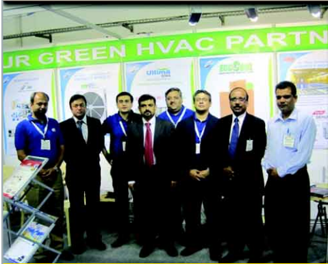
Big 5 – Dubai