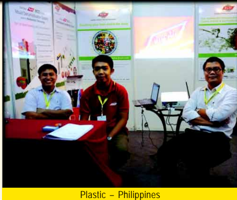
Plastic – Philippines