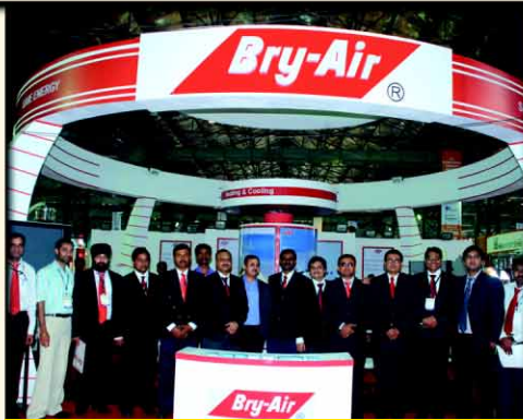
Plastivision – India