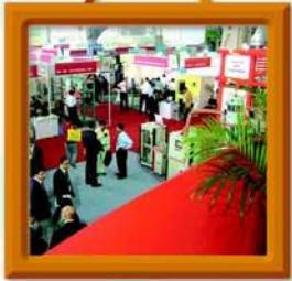
PlastIndia – India Feb., 2009

Bry-Air and DRI were present at almost all HVAC&R shows all over the world.