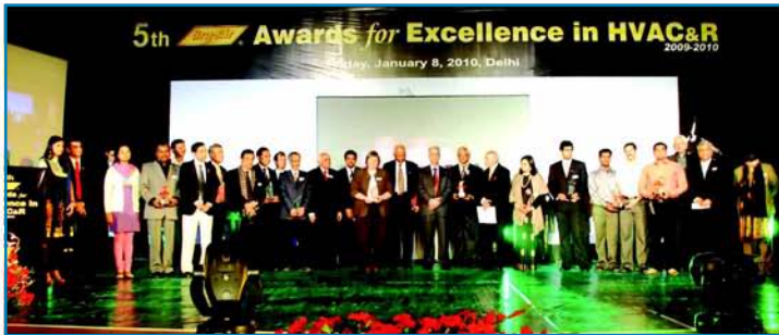
More on www.bryairawards.com

2010 started with the good news of the economy picking up. Our year also started with the 5 th Bry-Air Awards Celebration.