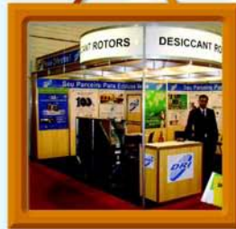
Febrava – Brazil Sept., 2009