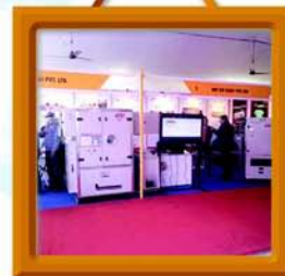
IPC – India Dec., 2009