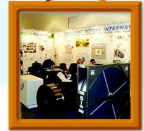
ISH – Germany March, 2009