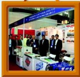
China Refrigeration — China April, 2009