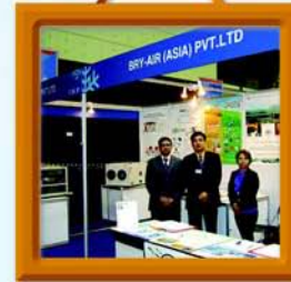
RHVAC – Bangkok Oct., 2009