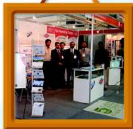
Big 5 – Dubai Nov., 2009