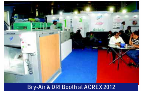
Bry-Air & DRI Booth at ACREX 2012