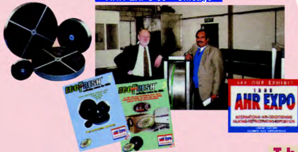
AHR EXPO'99 - Chicago

It was a 'roller coaster' of a Quarter with trade show participations and seminar across 3 continents . . . 5 countries - India, Singapore, China, USA and Germany. We were "floored" by the overwhelming response at our booths and presentations. We bring you a 'Snapshot' review !!