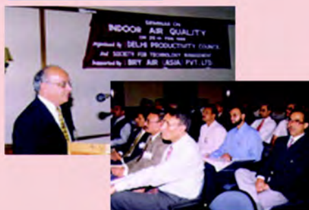
IAQ Seminar'99 - Delhi