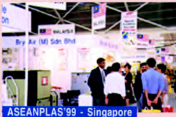
ASEANPLAS'99 - Singapore