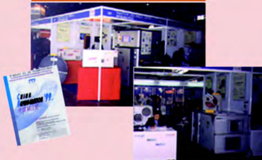
CHINA REFRIGERATION'99 - Beijing