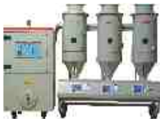
Centralized Drying System