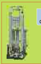
delair Heatless Adsorption Type Compressed Air Dryers