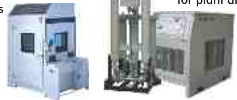
+ Test Chambers for testing Automobile components.