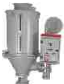
Hopper (Hot Air) Dryer