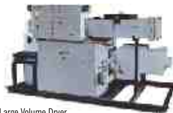
Large Volume Dryer