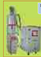
Dehumidifying Plastic Dryers - BPD Series