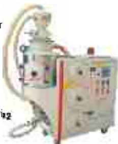
COMBO Drying Package