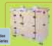
Mould Dehumidification System - MDS Series