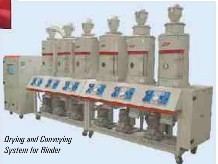
Drying and Conveying System for Rinder

Their requirement for drying Nylon, Polycarbonate, ABS and Acrylic is very stringent. They were unable to get the quality required with Twin Column Dryers. Rinder, then, contacted Bry-Air for a solution. Bry-Air provided them with Centralised Drying System with a single dryer along with six hoppers combination. Since its installation in Sept. 2003, Rinder is extremely satisfied with the results.