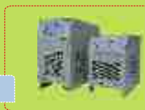
delair Refrigeration Type Compressed Air Dryers