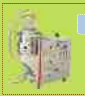
COMBO Dehumidifying drying Package for Hygroscopic Resins

Thailand March 17-20 2004, On display at T PLAS BT