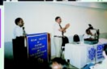
Seminar on IAQ at ISHRAE, Calcutta