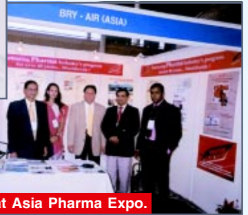
Bry-Air at Asia Pharma Expo.

Thanks to Minar's support, there is a large and growing population of Bry-Air Dehumidifiers in Bangladesh.