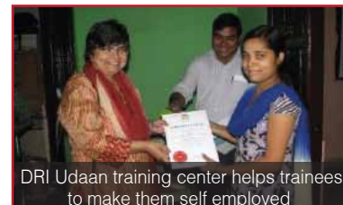
DRI Udaan training center helps trainees to make them self employed