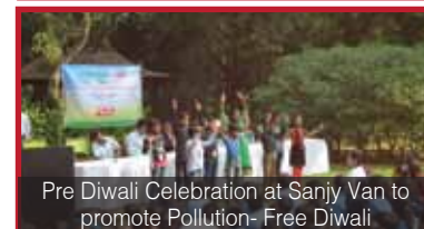
Pre Diwali Celebration at Sanjy Van to promote Pollution- Free Diwali