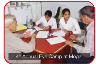
4 th Annual Eye Camp at Moga