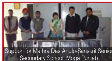
Support for Mathra Das Anglo-Sanskrit Senior Secondary School, Moga Punjab