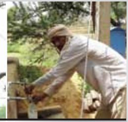
HYGIENE & SANITATION