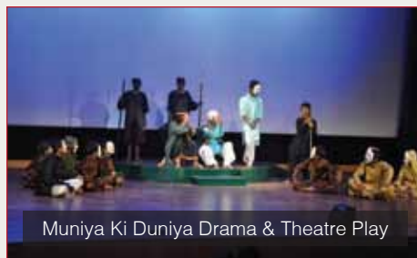
Muniya Ki Duniya Drama & Theatre Play

“Muniya Ki Duniya” A Satirical Comedy Play organized by Literacy India has been supported by Pahwa Group to promote “Beti Bachao, Beti Padhao” campaign.