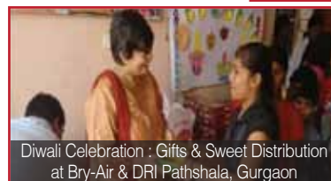
Diwali Celebration : Gifts & Sweet Distribution at Bry-Air & DRI Pathshala, Gurgaon