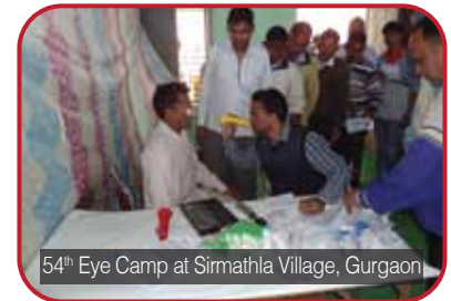
54 th Eye Camp at Sirmathla Village, Gurgaon