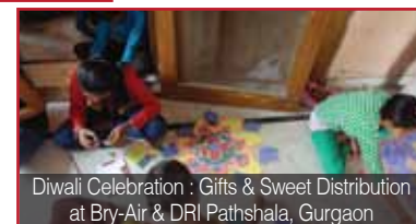
Diwali Celebration : Gifts & Sweet Distribution at Bry-Air & DRI Pathshala, Gurgaon