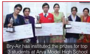
Bry-Air has instituted the prizes for top 3 students at Arya Model High School