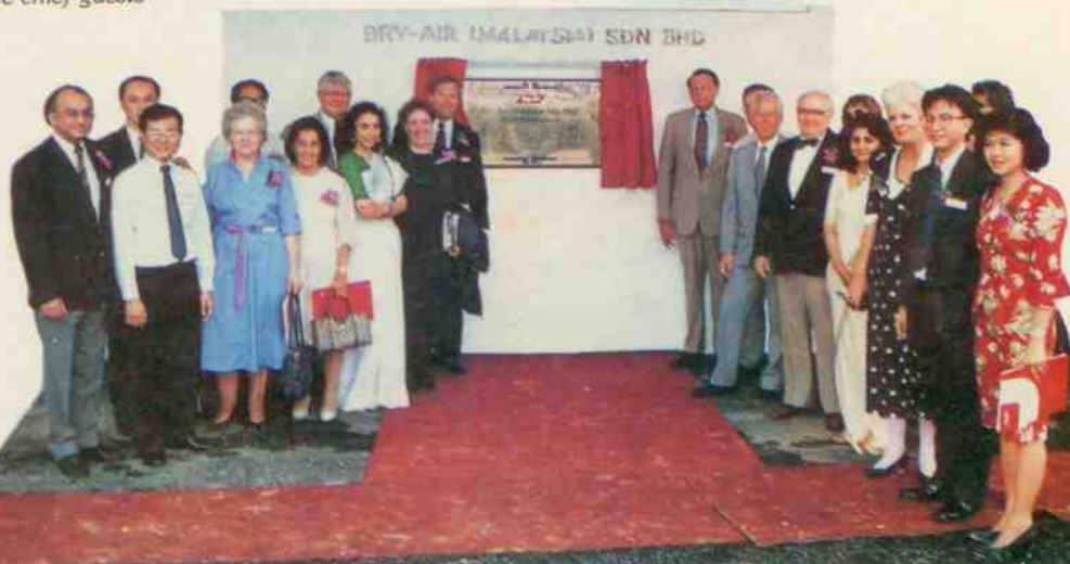
The Bry World family