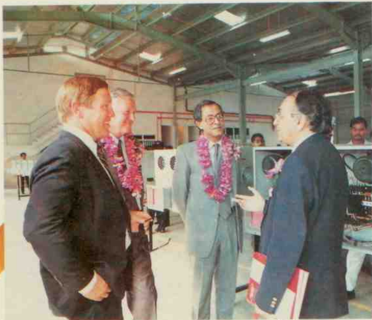
Explaining the merits of Bry-Air Dehumidifiers to the chief guests