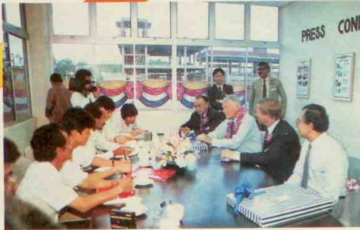
Meeting the press