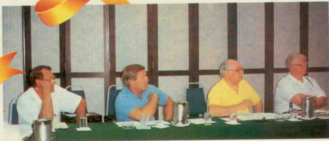
Deliberating on future strategies