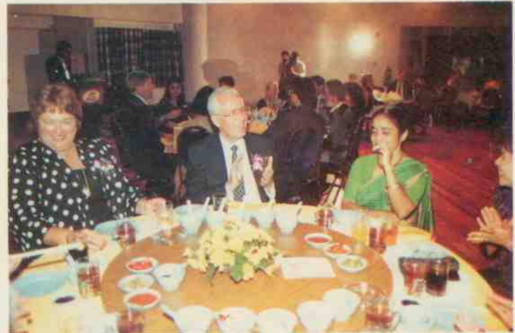
The celebration dinner