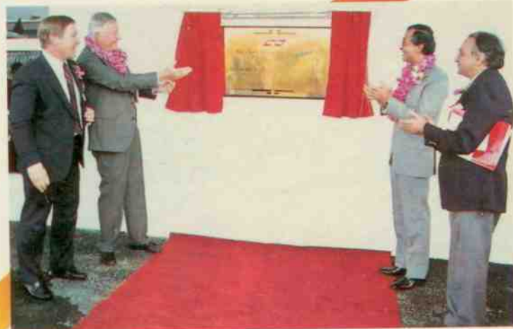
Unveiling a new era of environmental control